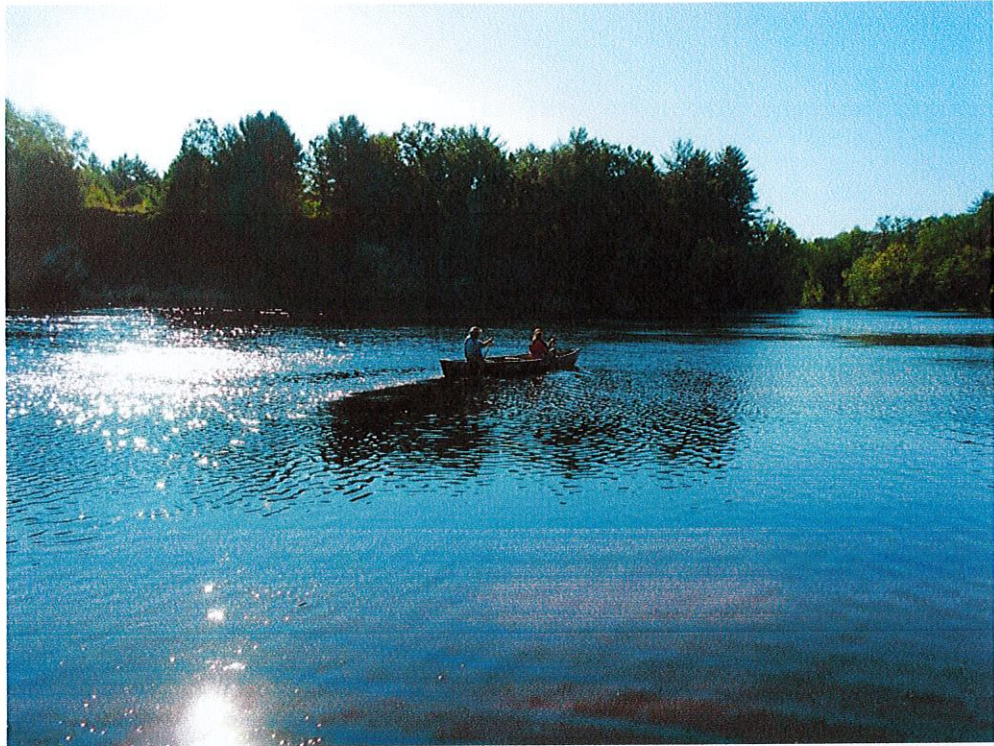
Canterbury Perambulator Mark Stevens, perambulating the town line via canoe. 4 September 2021.