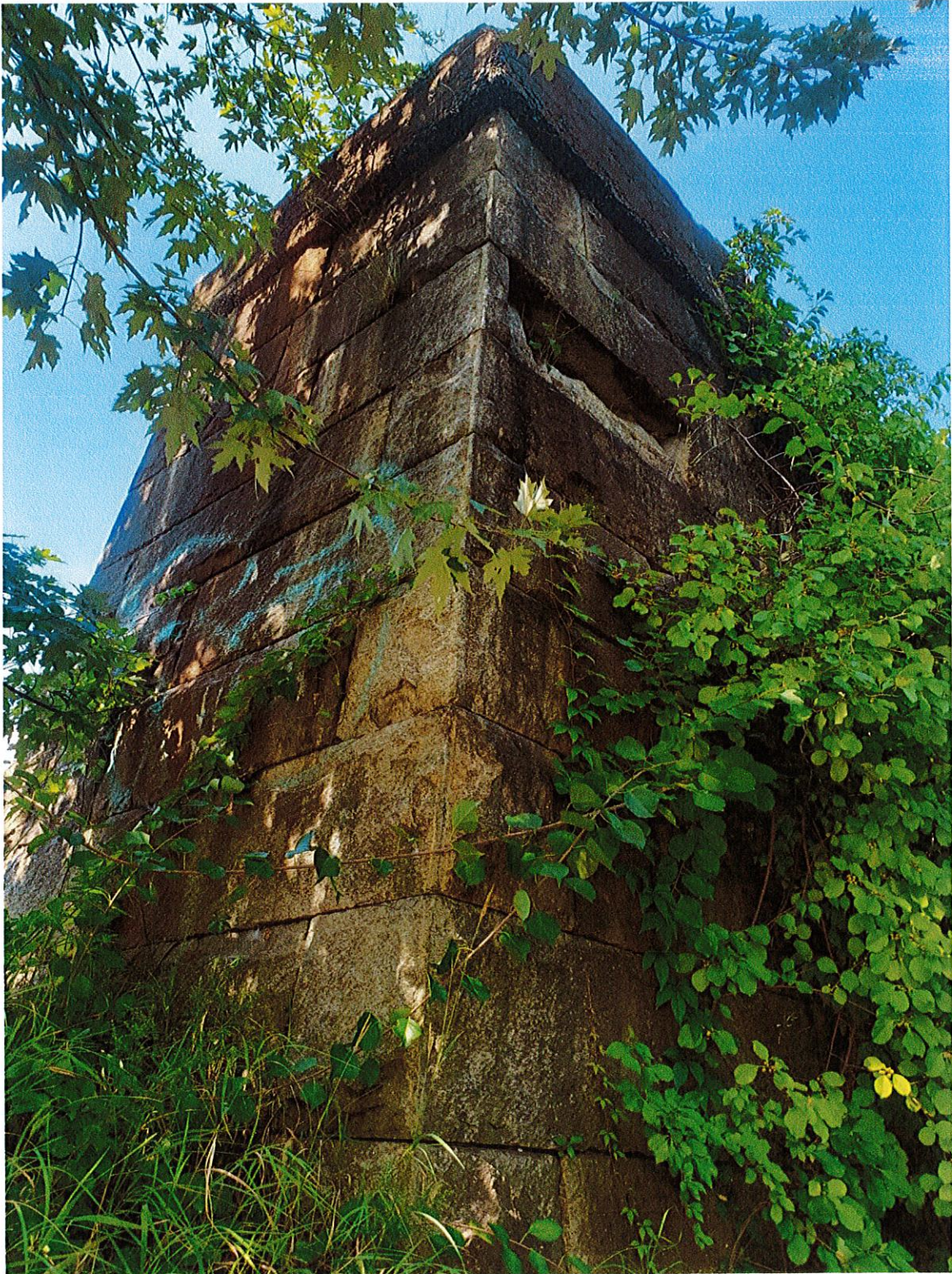
A search of the island and remaining bridge pier on 4 September 2021 did not discover any historic town line marks or bounds. Photo of south and east sides of pier.