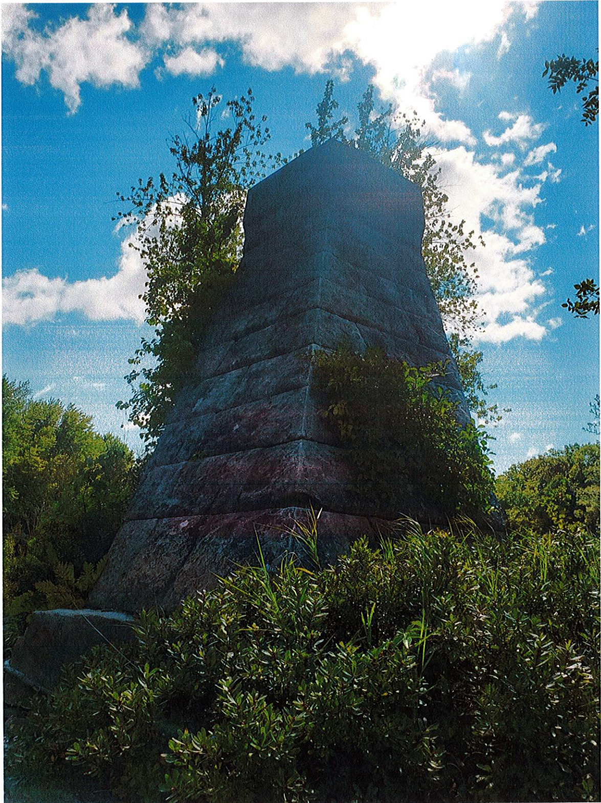
Photo of north and west sides of pier.